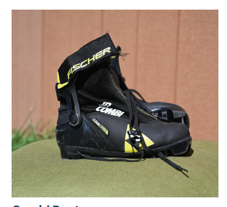
Combi Boots One pair fits both skis. Most have a high top, a few smaller ones don't.