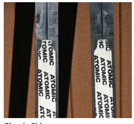
Classic Skis Classic skis have a patch of skin or a pattern cut into the middle section.

Equipment is distributed at the beginning of the season. Rental equipment remains with the athlete until the end of the season. Athletes and their families are expected to take reasonable care of rental equipment and return to the designated program after the end of the season.