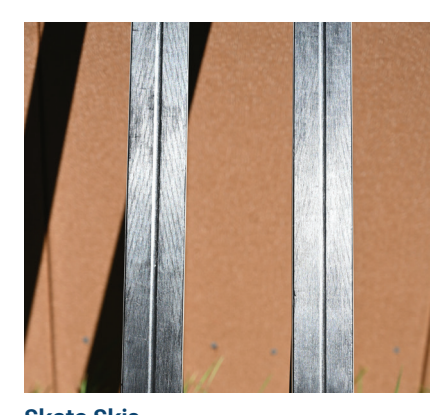
Skate Skis Skate skis are smooth from tip to tail.